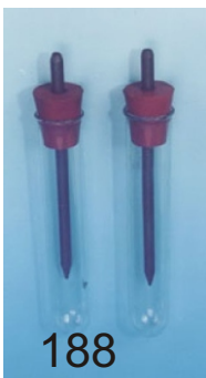
Carbon Electrode 188