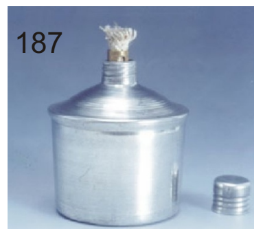
Burner, Methylated Spirit 187 Methylated Spirit burner is Metal, complete with wick, wick holder and cap.