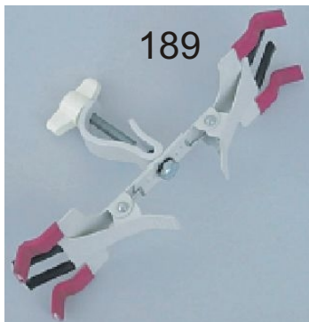
Double Burette Clamp 189 Made of powder coated mild steel strip. The two clamps are provided with a spring action to hold the burettes. Fitted with a boss head for holding to a support rod.